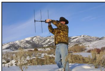
Bird on perch

The signal from the PowerMax is strongest if the receiver antenna is lined up in the same orientation as the PowerMax antenna. Since a falcon on a perch keeps its tail almost vertical, you will get the best signal if you hold your receiver antenna with its elements vertical. However, there are some cases, such as when the falcon is on a kill, when the transmitter's antenna could be nearly horizontal. In such a case, hold your receiver antenna horizontally.