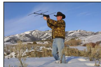
Bird on ground